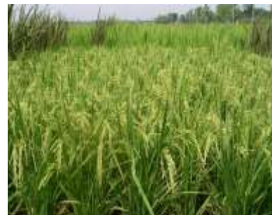
wP o T: we a avb36