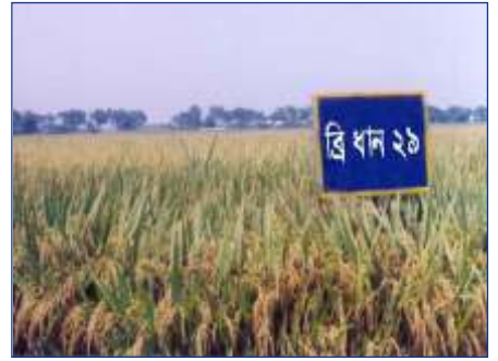
we a avb29

we a avb29 tev i v tg s mtgi GKwU bvx RvtZi avb | 1994 mtj G RvZwU emYwR h K wFwE h Z Pvl vevt h I Rb h Abtgv h b Ki v nq | we a avb29 Gi Pvj gvSwi wPKb I mv h v | Gi RxebKvj 160 w h b Ges D h PZv 95 tmwUwgUvi | GiU GKwU D h P dj b wlgZvm h ubæRvZ, hvi Mo dj b tn±i cÅZ 7.5 Ub |